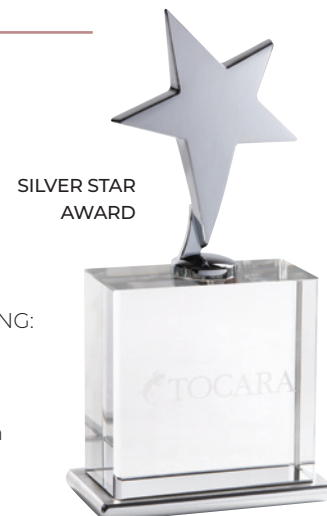
SILVER STAR AWARD

Consultants will receive jewellery vouchers with a Consultant Price equal to 50% of the retail price as a 50% discount is attributed at checkout. For full details on rank advancements to Senior Consultant and Silver Director and applicable rewards see the Compensation at-a-glance document in your back office. **Cash bonus awarded upon 2nd consecutive month qualification.