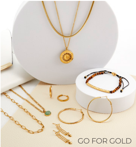
GO FOR GOLD

Product included: Riley Hoops, Milena & Esme Necklaces, Selah Bracelet (Tiger's Eye), Clarisse Chain, Mia-Rae & Daphne Earrings.