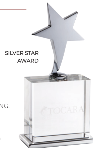
SILVER STAR AWARD

For full details on rank advancements to Senior Consultant and Silver Director and applicable rewards see the Compensation at-a-glance document in your back office. **Cash bonus awarded upon 2nd consecutive month qualification.