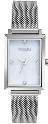
LEVEL 2 - "Watch Me Qualify" Reward $152 value.

†As a Consultant, you'll earn 25% or more of your sales. With an average $800 party, you'll earn $200. Increased percentages based on achieving personal sales bonus levels each month. Consultants receive Certificates with a Consultant Price equal to 50% of the retail price.